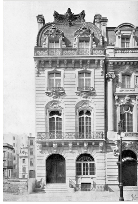
Upper East Side Mansion

The Upper East Side of New York City was, and is still, much larger than the Lower East Side. Spanning the areas of 59th Street, 110th Street, 5th Avenue, and the East River, the Upper East Side was also an attractive place for immigrants. In the late 1860s development of the Upper East Side began. The building of brownstones and mansions on 5th Avenue attracted a more wealthy population of highsociety moguls, debutantes, scions, and heirs who made the Upper East Side a very ritzy and glamorous place to live. Adding to its appeal, the new concept of public transportation made it easier for Upper East Side residents to travel throughout New York City. Included among the upper-class families that relocated to the Upper East Side were The Rockefeller, The Kennedy, and Roosevelt families.